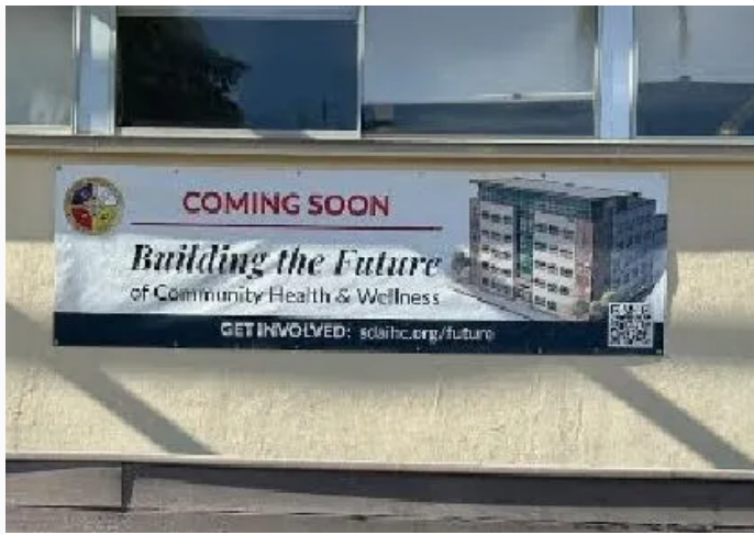
Banner displays 6-story building carved into side of Maple Canyon.

That's a worthy intention. But it isn't a binding commitment. If the bait-and-switch gambit succeeds, the City will set an audacious precedent.