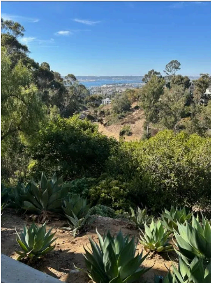
Beautiful Maple Canyon.

Let's see if we have this right: The same city government that's paying to restore the canyon might allow development that would deface it.